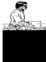
FIGURE VII:1-1. HORIZONTAL MEASUREMENT.